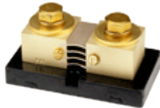
Type MLC 1,000 - 1,200 Amps in 50 millivolt