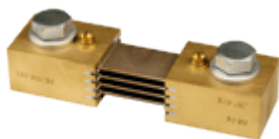
Type TRW 100 - 600 Amps in 50 millivolt