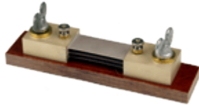
Type LAB 1 to 2,000 amps

Phone: 847-671-7676 Fax: 847-671-7665 www.dalec.com sales@dalec.com