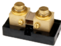
Type MLB 170 - 600 Amps in 50 millivolt